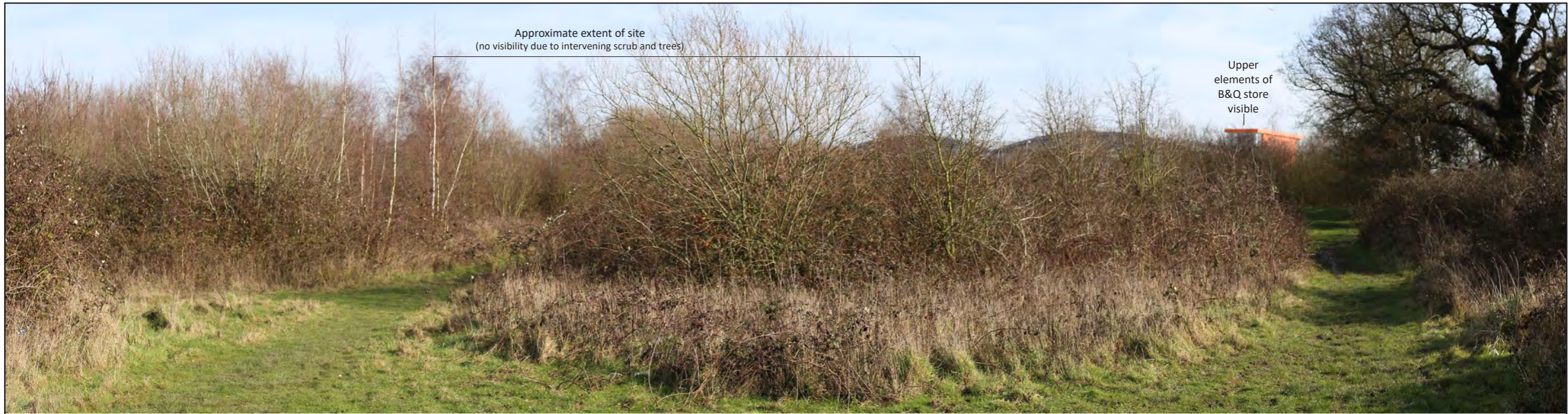
Viewpoint 11 - View northeast from well Camp Hillfort (SM)