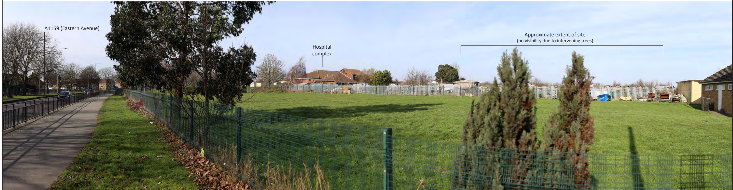
Viewpoint 12 - Viewing northwest from the A1159 (Eastern Avenue)